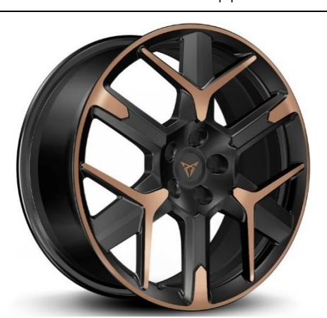
19" Hailstorm Copper