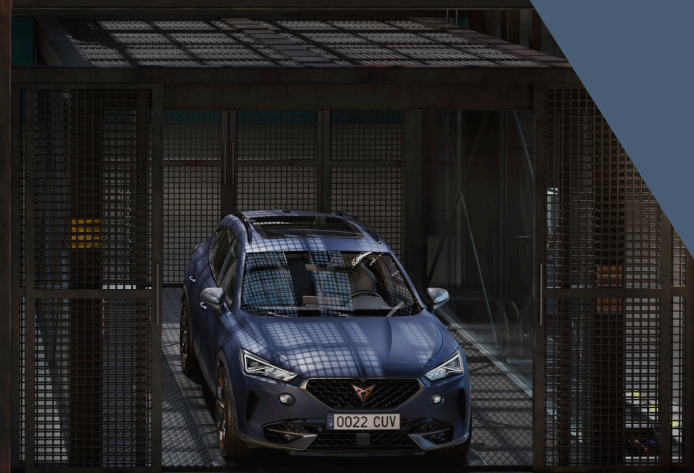
CUPRA FORMENTOR V