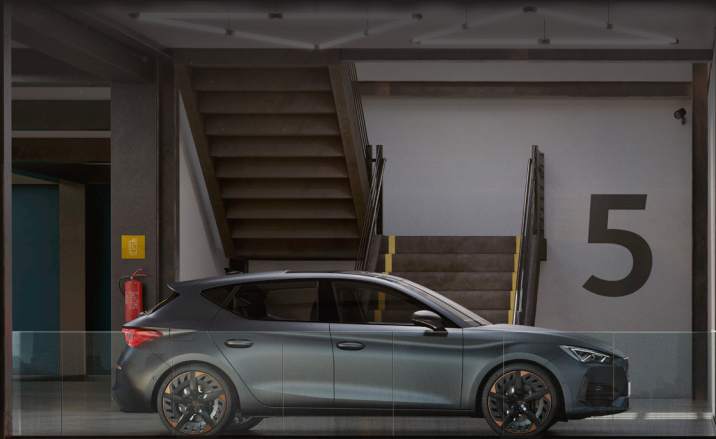
CUPRA LEON V

With flexible lease options, plenty of models to choose from and more, there's loads of ways CUPRA can work for you.