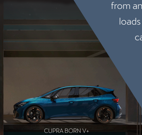
CUPRA BORN V+